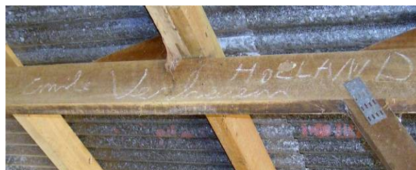
Bjorn Aurprin, Sweden