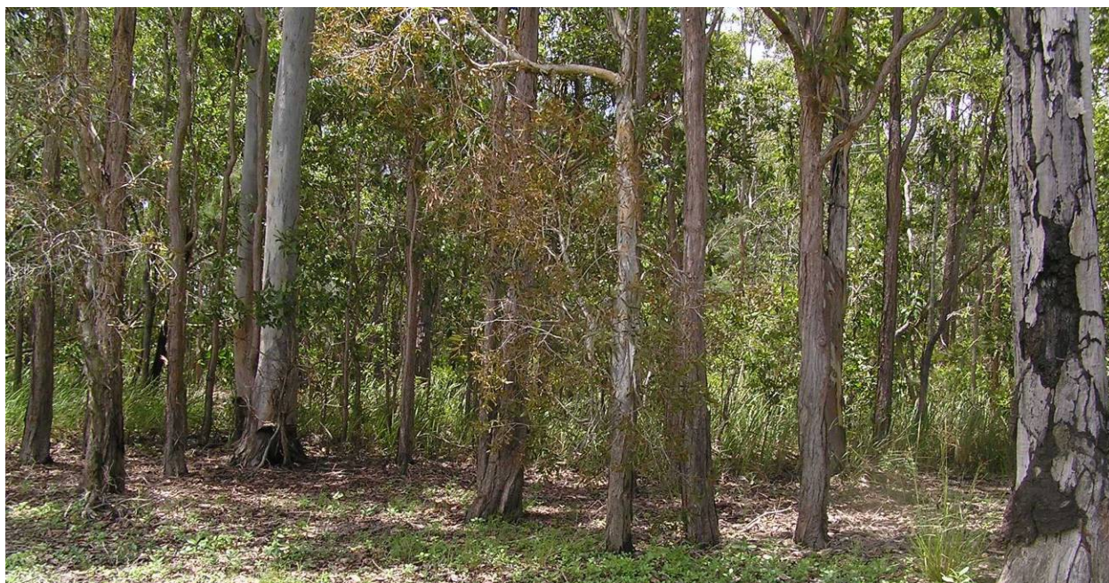
Not much room for boats before some clearing

It is one thing to secure tenure to land, quite another to enjoy its benefits. The land in question was covered in logs that needed to be sawn up and moved and stumps that needed to be grubbed out with mattock, axe and shovel. But these were days of wooden boats and iron men (and women) who were used to physical exertion and expected to work for anything worthwhile. So while the ladies and girls raised money by catering at Potato Growers Association field days, amongst other things, the men got busy cleaning up. The 1966-67 drought was something of a blessing in allowing trees and stumps to be cleared from the foreshore and nearby islands. That drought ended with a bang in March 1967 when 800 mm rain fell in three days. And on the fourth day it filled.