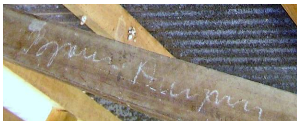
Emile Verhoeven, Holland