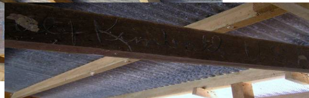
Olaf Kimball USA